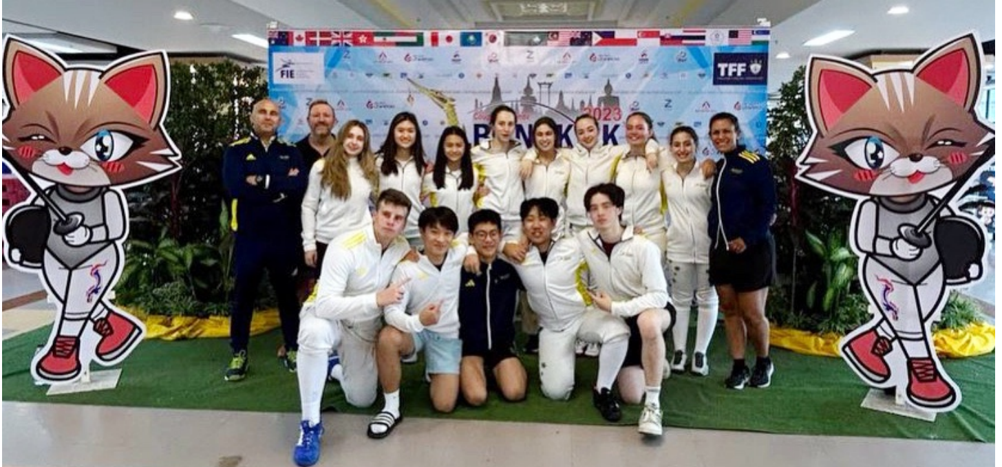
FIE Junior Foil World Cup – Bangkok

NSWFA acknowledges and gives respect to the Gadigal of the Eora nation, the traditional custodians of the land on which the Duncan Fairweather Fencing Centre stands, and to the traditional custodians of the lands on which our clubs stand.