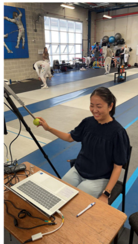
Learning new skills volunteering as a video operator for the livestream from the finals piste

To get involved, or for more info, please email secretary@nswfencing.org.au