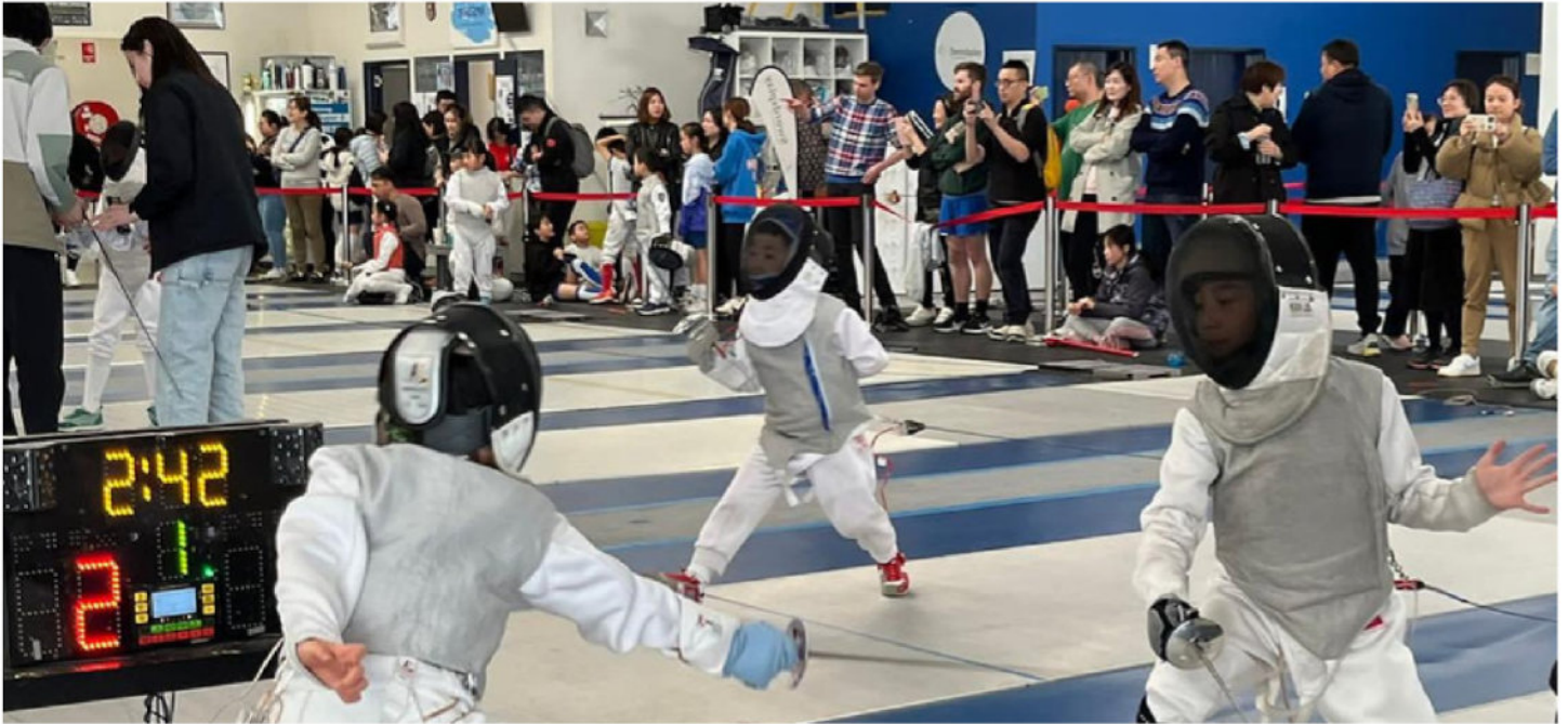
Action at the Koala Mini Challenge and Friendship Cup

NSWFA acknowledges and gives respect to the Gadigal of the Eora nation, the traditional custodians of the land on which the Duncan Fairweather Fencing Centre stands, and to the traditional custodians of the lands on which our clubs stand.